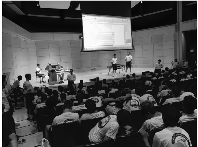
Above: The Federalists convene to make party decisions

The Counselor eventually realized that the dishwashing attendants were on their own dinner break, and he notified them that there were many dishes to clean. However, when the Counselor and the attendants returned to the kitchen area, they were pleasantly surprised to find that the citizens of Boys State had taken matters into their own hands. When asked just why they were taking the mess hall workers' jobs by stacking their own dishes and wiping down their own tables, the boys collectively claimed that they "[had] to clean this up." Needless to say, the kitchen staff were quite impressed. Through only a small act of kindness on a busy day, and especially one which could be so easily overlooked, the Boys State citizens demonstrated their immediate cooperation with each other and appreciation not only for the Radford campus staff, but also the counselors whom they emulate. The Counselor was impressed at the chain reaction he had seemingly started simply by stacking his dishes and was proud to find that indeed, the citizens of Boys State really do listen, or in this case, pay close and thoughtful attention.