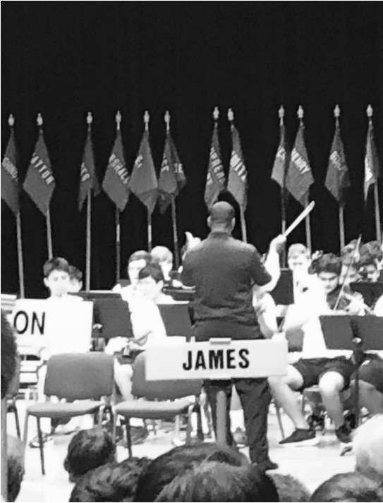
Above: The band plays for the Lt. Governor.

Virginia Lieutenant Governor Justin Fairfax stopped by Boys State on Wednesday to share about his duties, personal journey, and insight about running for public office. Lieutenant Governor Fairfax explained his responsibility of overseeing the Senate of Virginia, which includes voting for bills in the event of a tie. He further detailed that he has been forced to use his tie breaking vote a total of 6 times during the 2018 legislative session; 4 of which were on a budget-related vote.