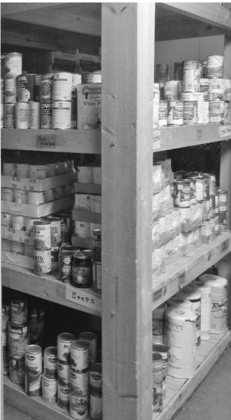
Below: The shelves at Daily Bread after Boys State contributions