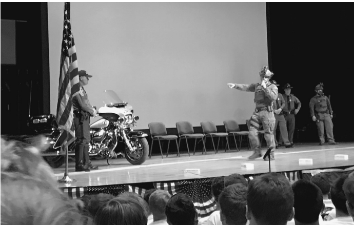
Left: Troopers are introduced.

from multiple portions of the federal government about allowing teachers in schools to carry firearms to protect their students and colleagues. Both topics carry weight, both in concept and in the context of the experiences of the speakers. Despite the potentiality for flaring passions and fierce defensive accusations due to these topics being highly controversial, the question and answer session was able to maintain order and allow all questions, regardless of their topic, to be asked and answered.