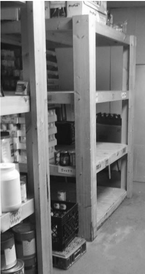
Above: The shelves at Daily Bread before Boys State contributions