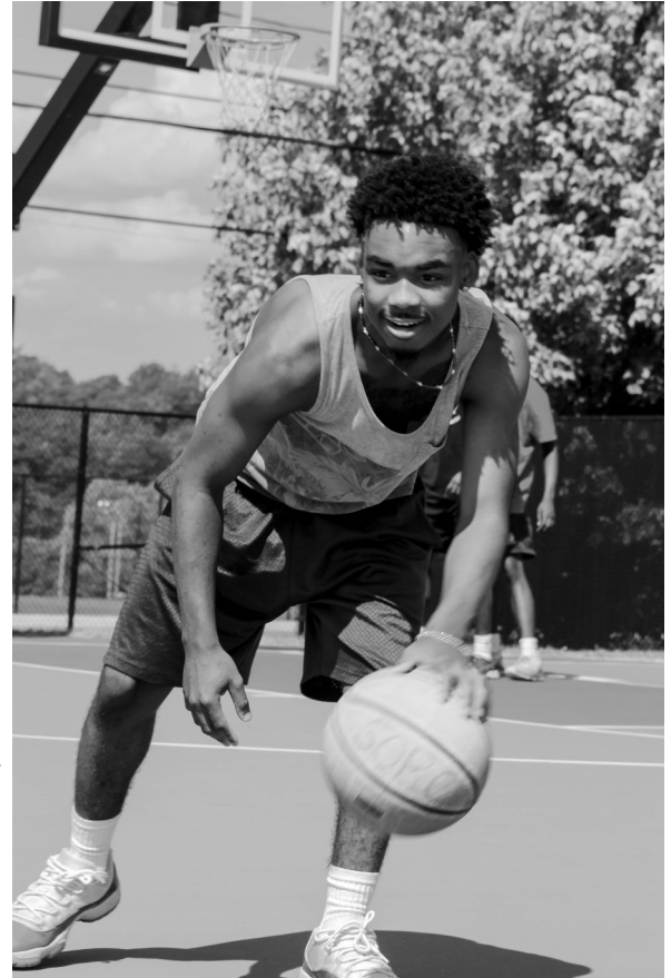
Left, Above: Citizens enjoy sporting events