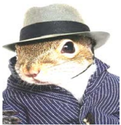
Left Photo: Nelson Nutcracker, leader of the local rodent gang.

The investigation into the recent homicide of Larry the Lizard as mentioned in yesterday's paper has brought forth new evidence. Harry the Hawk was cast under immediate suspicion due to his predatory nature and criminal nature, but when sheriffs caught him and interrogated him, he provided an alibi that was verified by a witness. Brittney the Bunny reported having been chased by Harry the Hawk on nearly the opposite side of the campus at the estimated time of Larry's death. A pile of nut shells behind a tree near where Larry was killed points to a new suspect: Nelson Nutcracker, the squirrel leader of the local rodent gang. If you have any information as to the whereabouts of Nelson or any information relating to the case at all, please pass it on to one of the city sheriffs.