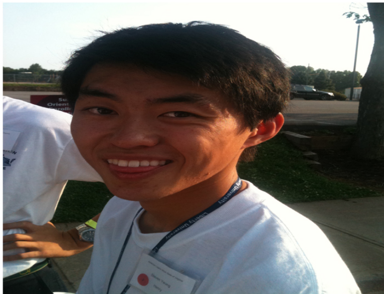
Federalist of Henry City

Hey, I just met you... And this is crazy... Now here's my number... So call me maybe